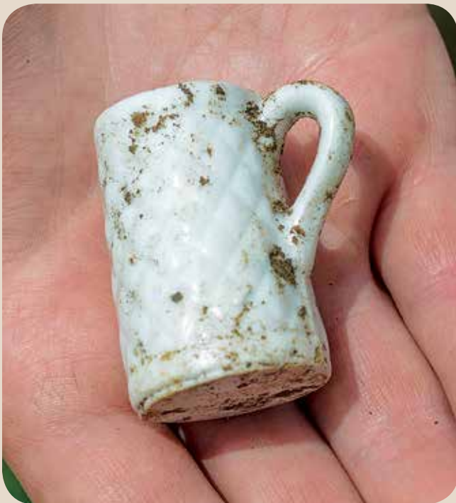
A child's porcelain cup was also uncovered.

One of the key findings is the paucity of animal bones, which suggests the residents consumed very little meat.