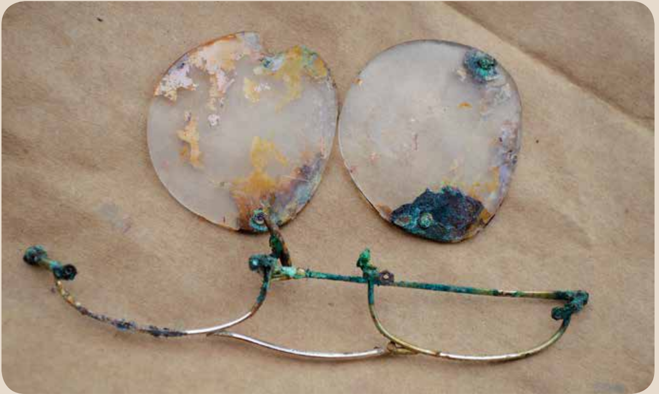
These eyeglasses were found during excavations in Pardeesville, where Italian and Eastern European miners, laborers, and their families lived.

Lattimer mines just north of Hazleton. The archaeologists also interviewed third- and fourth-generation descendants of the miners and researched historical news accounts and coal company archives.